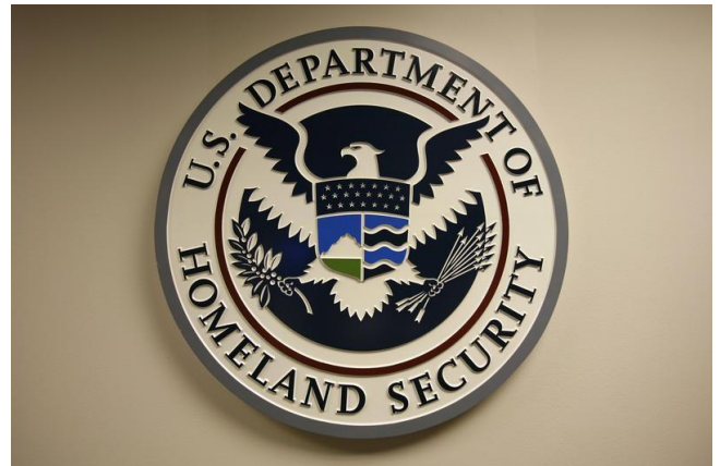
U.S. Department of Homeland Security emblem is pictured at the National Cybersecurity & Communications Integration Center (NCCIC) located just outside Washington in Arlington, Virginia September 24, 2010.

Congress should act when its members return in September to pass legislation that ensures effective oversight, limits the department's ability to transfer or reprogram money toward increasing immigration detention or other enforcement programs, and refuses to authorize