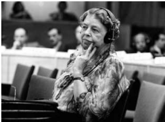
Eleanor Roosevelt and the Universal Declaration of Human Rights