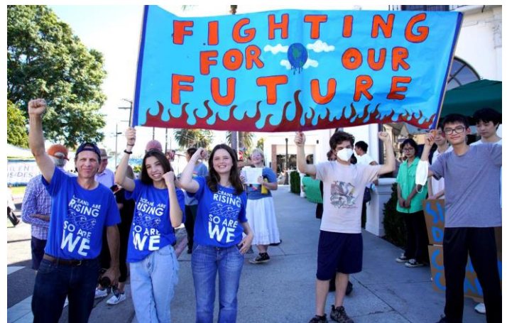
Community rally for the Global Climate Strike