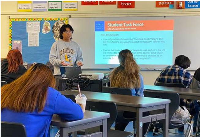
Classroom presentation with a film screening

See more of our students in action at www.hrwstf.org