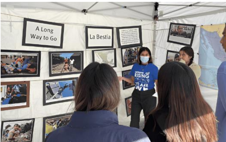
Experiential tent exhibit